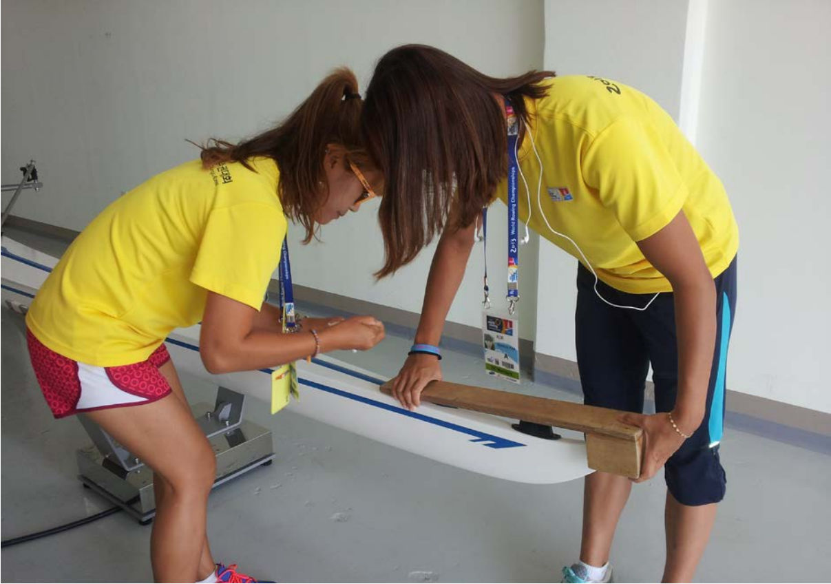
Fixing of GPS plate