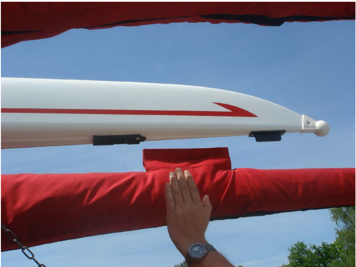
GPS Mounting Plate1