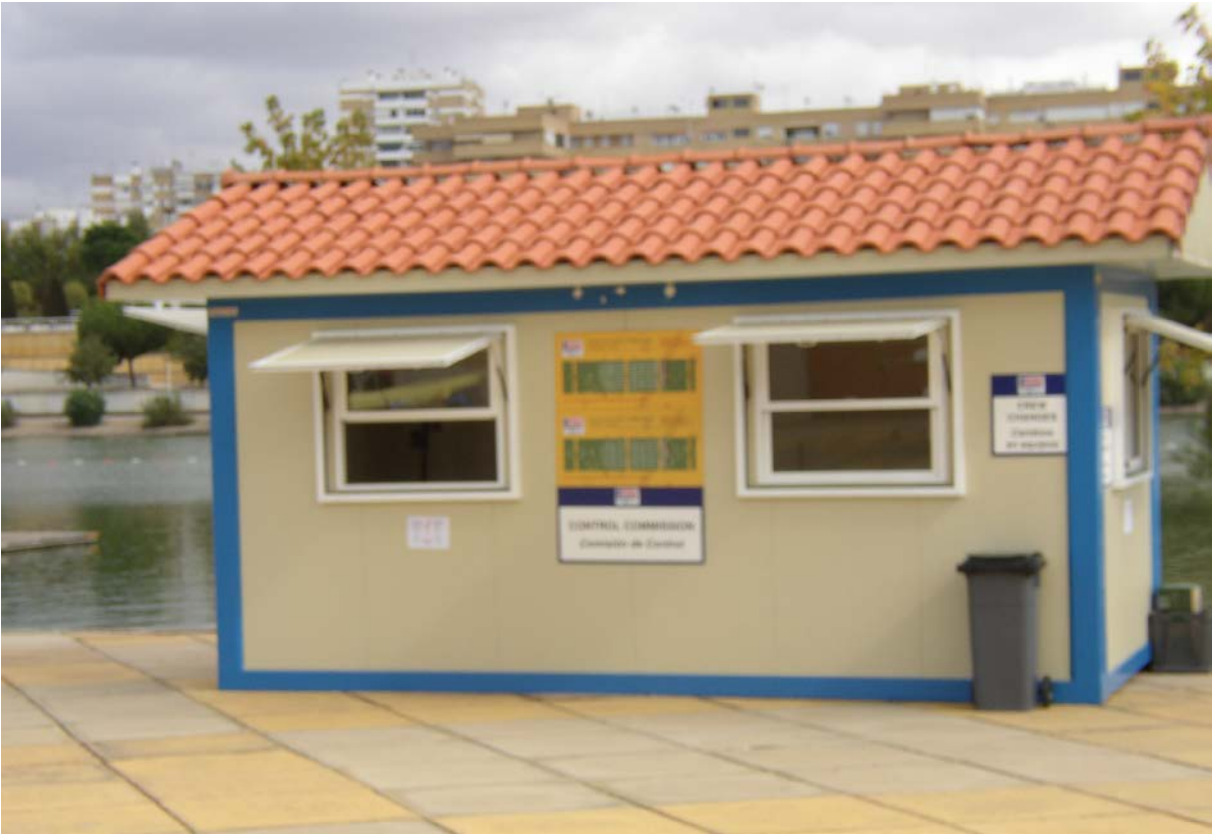
Control Commission Seville