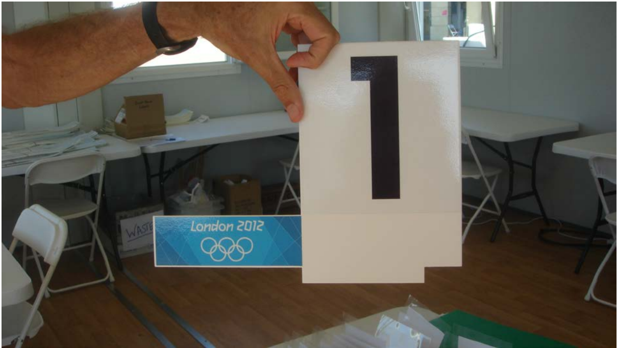
Bow Number London 2012