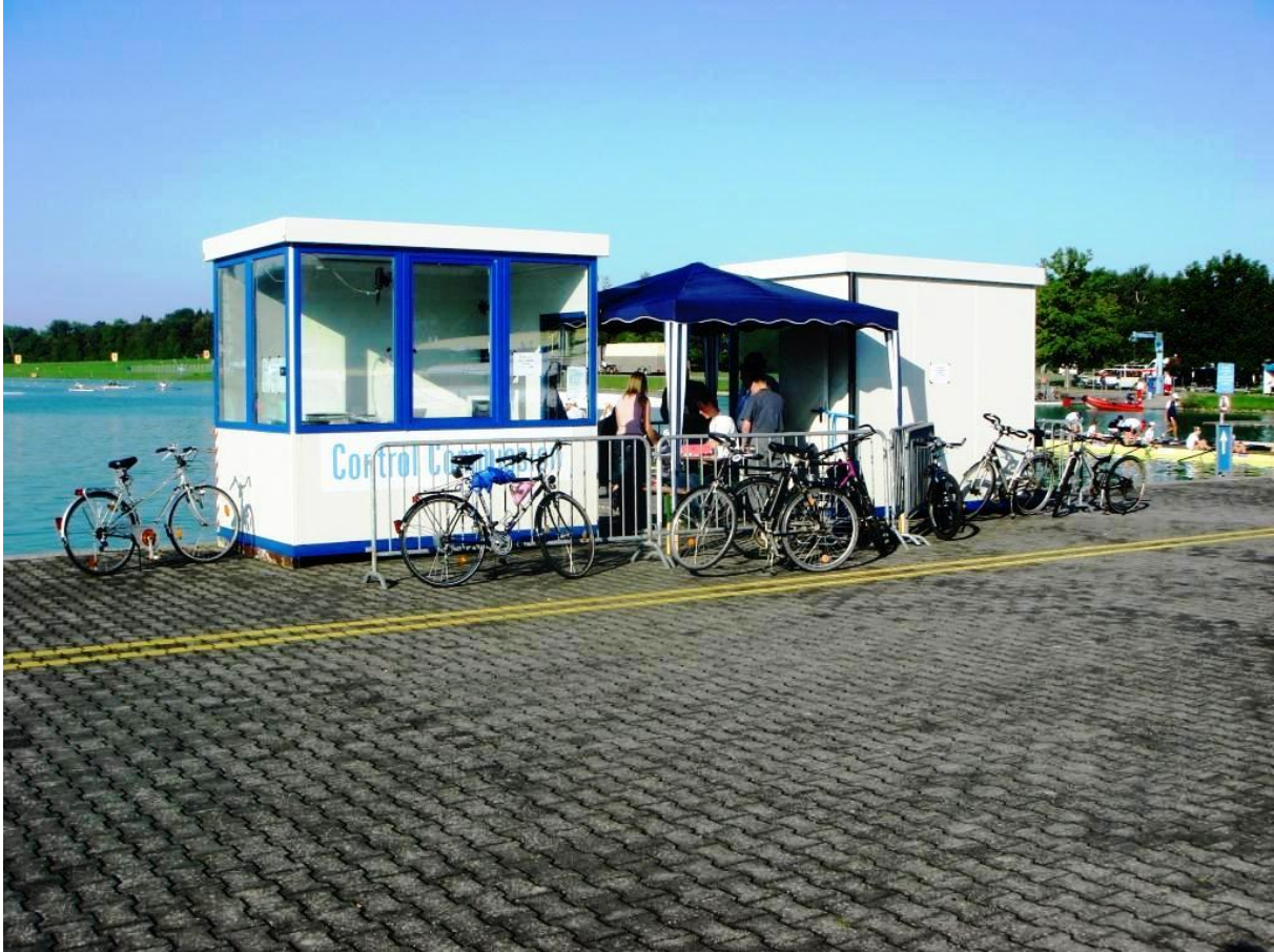
Control Commission Munich