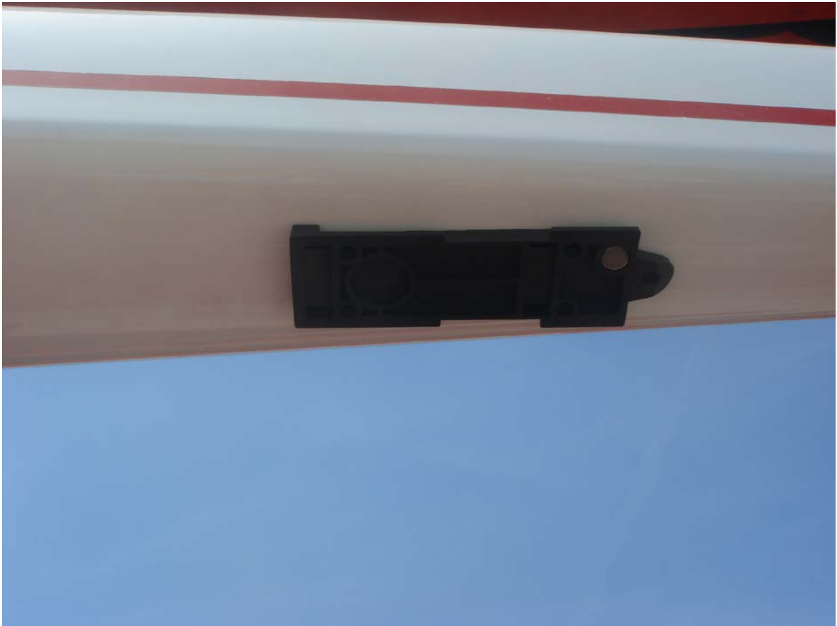
GPS Mounting Plate2