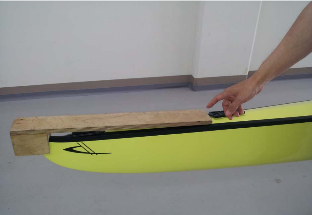
Fixing of GPS plate