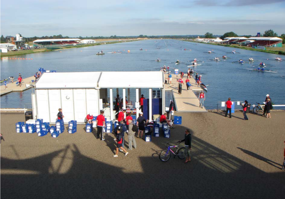
Control Commission Eton