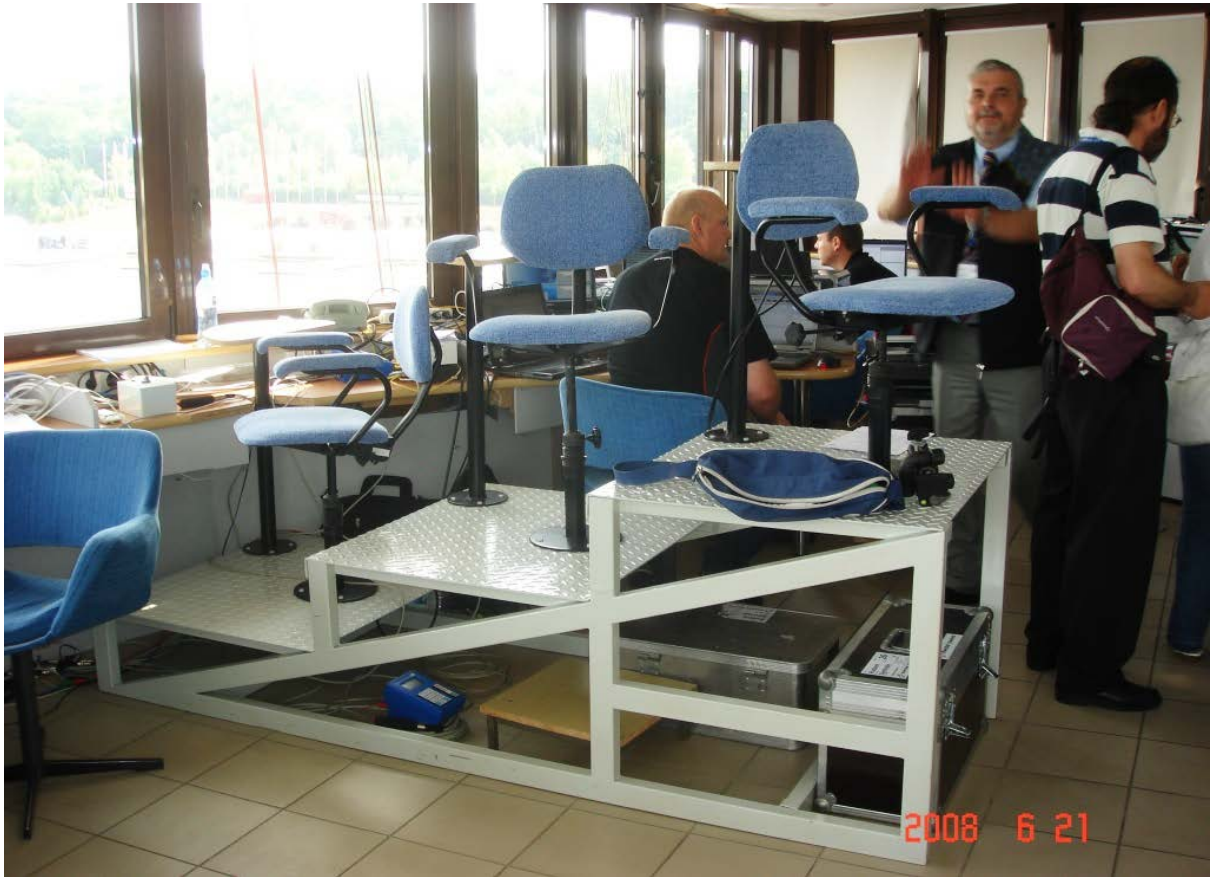
Finish Line seats Poznan