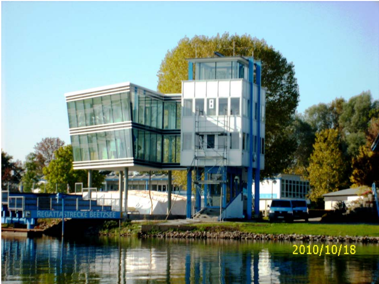
Brandenburg Finish tower