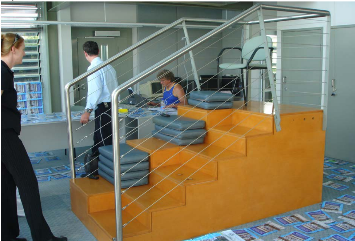
Jury Seats Finish Tower Sydney