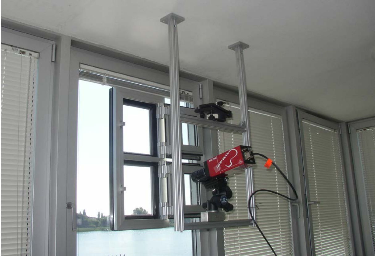
Photo-finish camera fixing Brandenburg