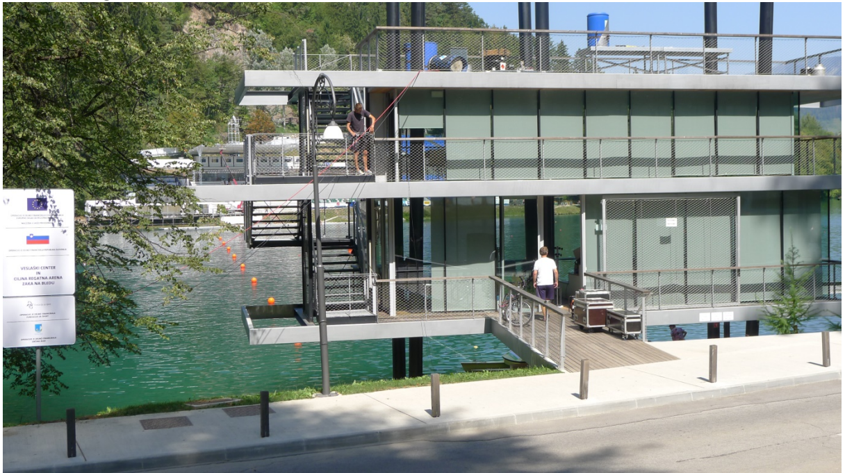
Finish Tower Bled