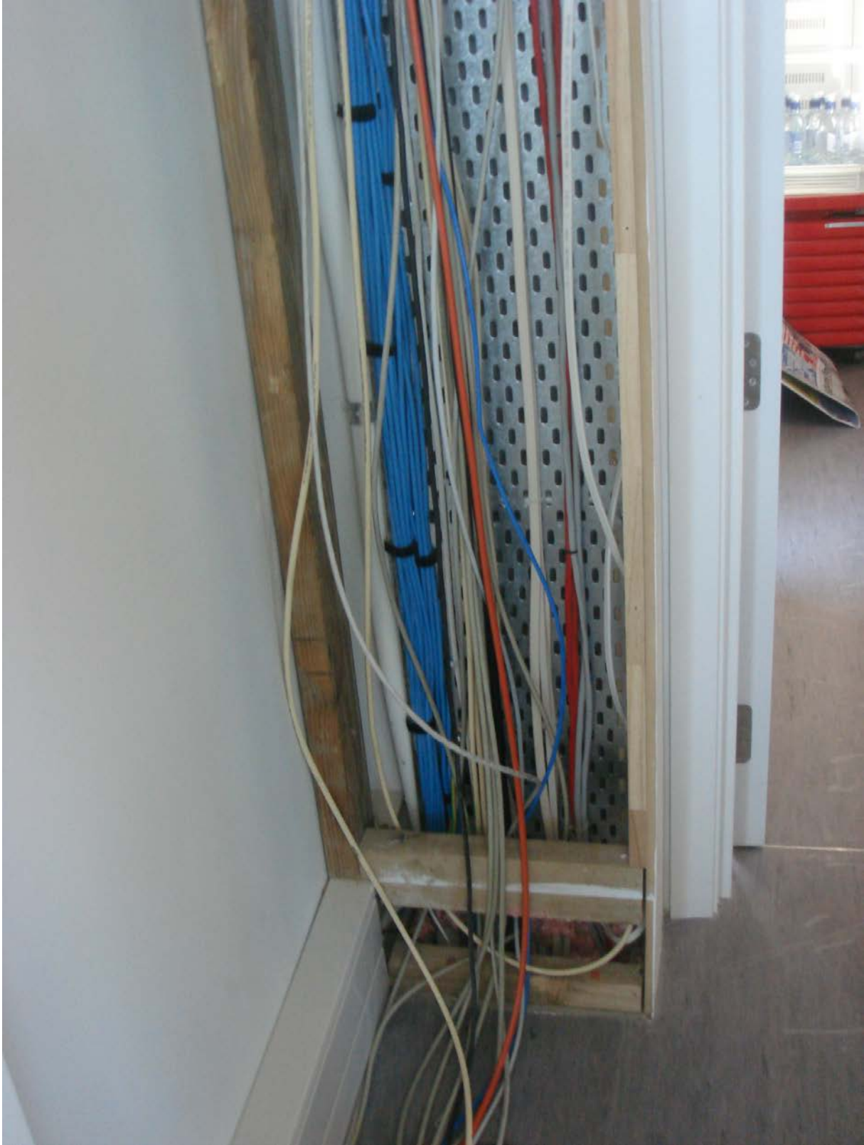
Cable Conduit Bled