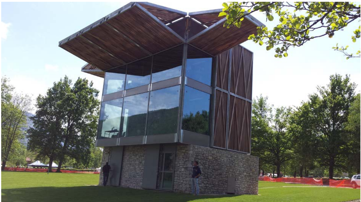
Aiguebelette Finish Tower