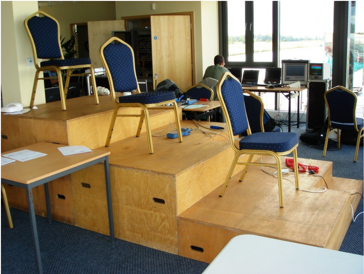
Jury seats in Finish Town Eton