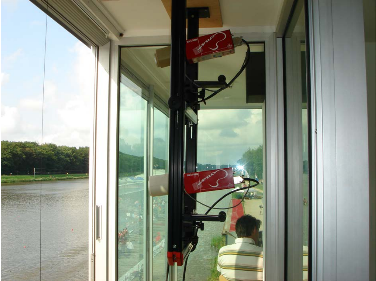
Photo-finish cameras fixing Amsterdam