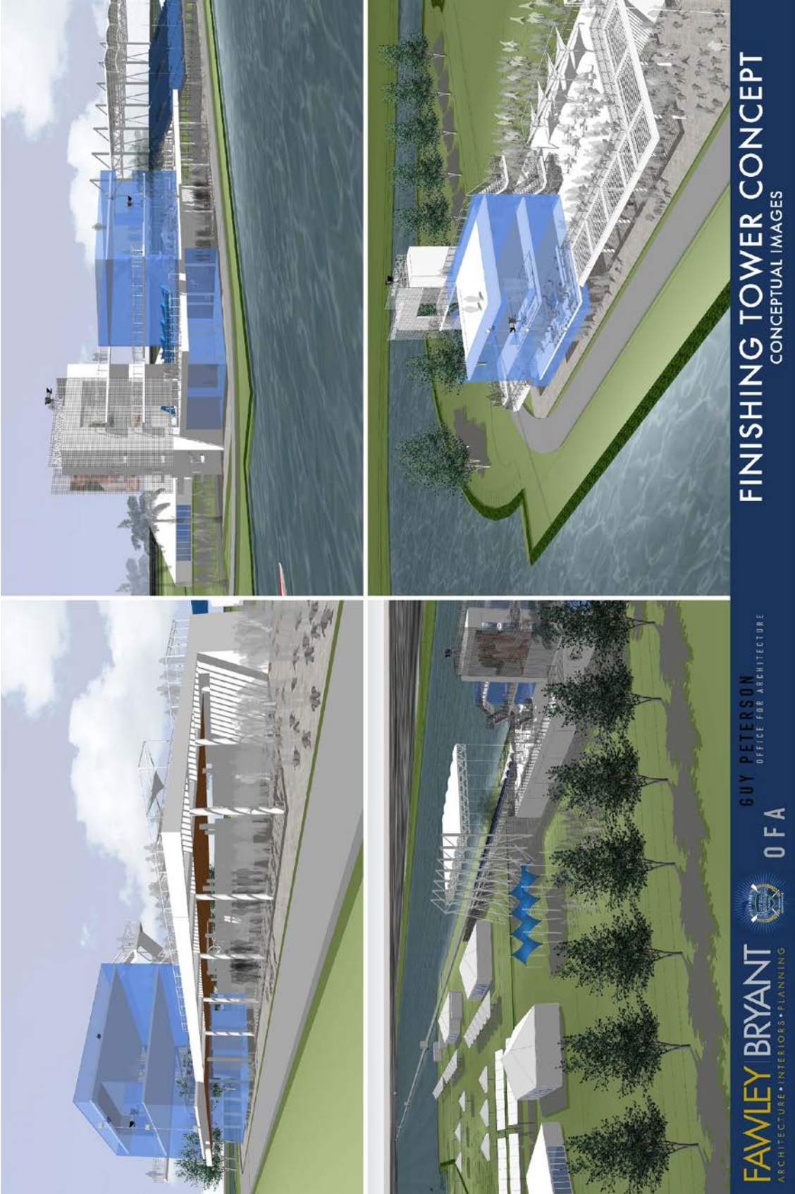
Benderson finish tower conceptual images four renderings

FINISHING TOWER CONCEPT CONCEPTUAL IMAGES